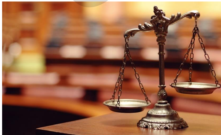
Using consistent subjects and verbs gives your writing balance.

A complete sentence always contains at least one subject and one verb . These subjects and verbs must match each other in number . Number refers to a way to divide words into two groups: singular and plural. Singular subjects are always used with singular verbs; plural subjects are always used with plural verbs. This consistency is known as subject-verb agreement .